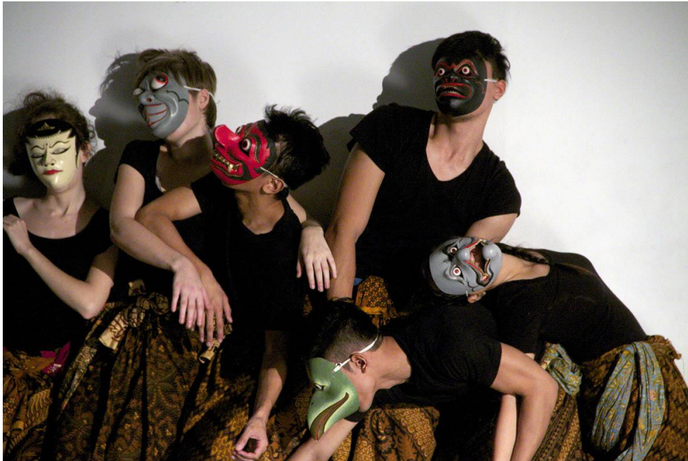
ITI students performing traditional Indonesian theatre Wayong Wong